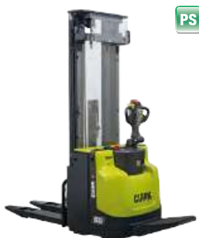
SX12/16 24 VOLT PALLET STACKER - PLATFORM VERSION 1200 1600 kg