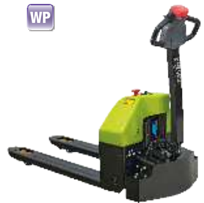
WP15 2x12 VOLT PALLET TRUCK 1500 kg