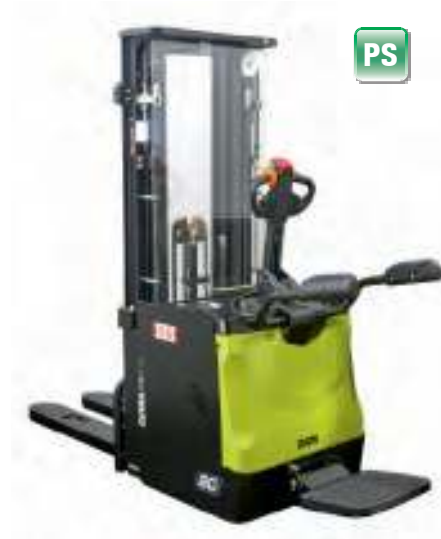
PSX 16 24 VOLT PALLET STACKER - PLATFORM VERSION 1600 kg