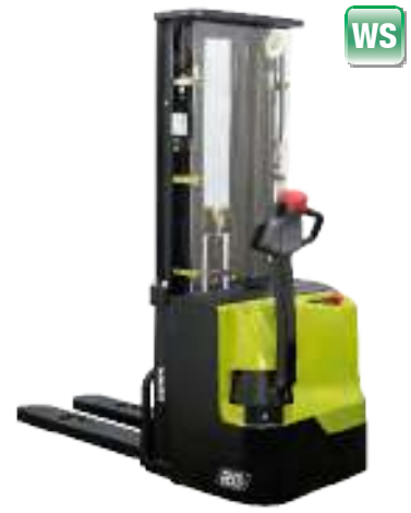
WSX12/14 24 VOLT PALLET STACKER 1200 kg 1400 kg