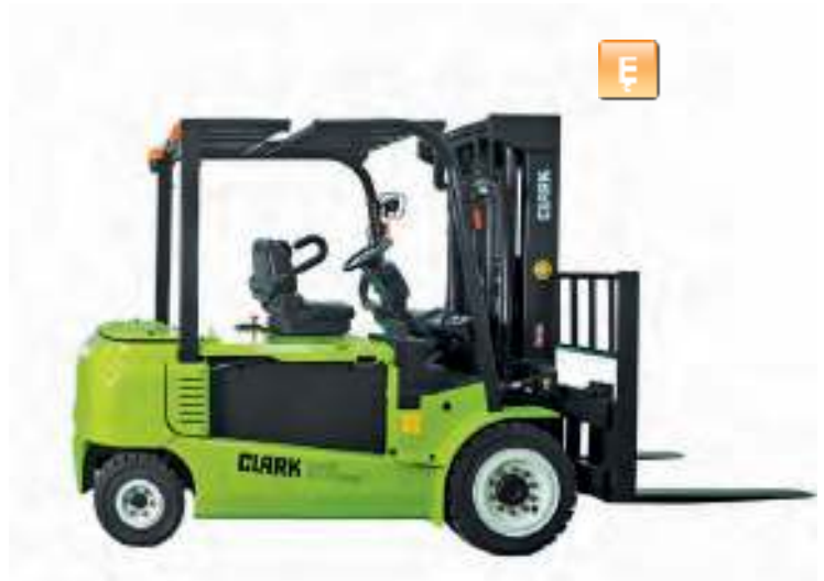
GEX40/45/50 4-WHEEL 80 VOLT 40 45 50 4000 4500 5000 kg