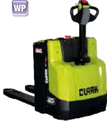
PX20 24 VOLT PALLET TRUCK 2000 kg