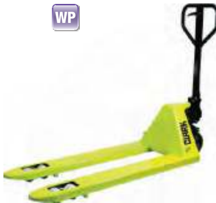
CLARK HAND PALLET TRUCK 2500 kg