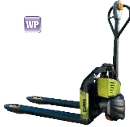
WPiO12 24 VOLT LITHIUM-ION HAND PALLET TRUCK 1200 kg