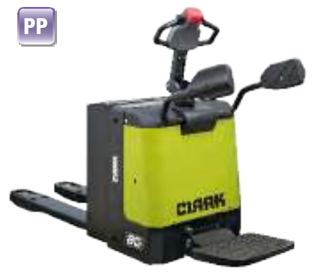
PPX(S)20 24 VOLT PALLET TRUCK 2000 kg