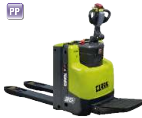
PX20 24 VOLT PALLET TRUCK - PLATFORM VERSION 2000 kg