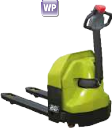
WPX18 2x12 VOLT PALLET TRUCK 1800 kg