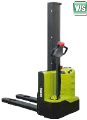
WS10M 2x12 VOLT PALLET STACKER 1000 kg