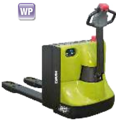
WPX20 24 VOLT PALLET TRUCK 2000 kg