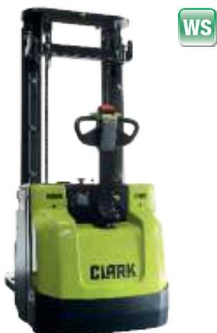
SX 12/16 24 VOLT PALLET STACKER 1200 1600 kg