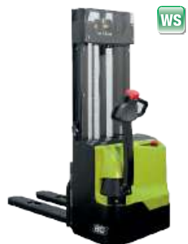
WSXD20 24 VOLT PALLET STACKER - MULTI-PURPOSE TRUCK 2000 kg