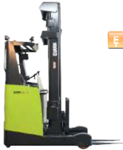
SRX14/16 48 VOLT 14 16 1400 1600 kg