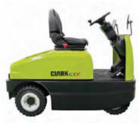
CTX40/70 3-WHEEL 48 VOLT 40 70 4000 7000 kg