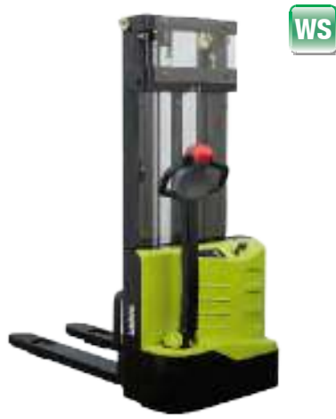
WS10 2x12 VOLT PALLET STACKER 1000 kg