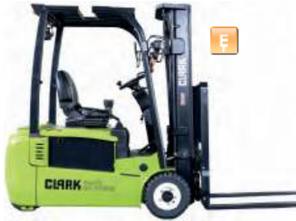
GTX16/18/20s 3-WHEEL 48 VOLT 16 18 20s 1600 1800 2000 kg